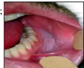
WHITE PATCHES ON THE GUM AND CHEEK AREAS

Leukoplakia is a condition where white patches form on the soft tissues of the mouth; and can not be removed. Its cause is unknown, but smoking is believed to trigger leukoplakia. Of the different types of tobacco, chewing tobacco and snuff play a key role in causing leukoplakia. As many as three out of four regular users of “smokeless tobacco” products eventually develop leukoplakia where they hold the tobacco against their cheek(s). In most cases, leukoplakia is non-cancerous, but it can be dangerous and may lead to cancer in a small percentage of individuals. It’s also important to note that many oral cancers appear next to areas of leukoplakia.