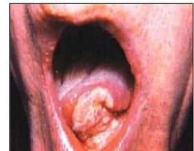
ORAL CANCER ON THE TONGUE

Oral cancer includes cancer of the lips, tongue, mouth, and pharynx (throat). Even though oral cancer is a lesser known cancer to the public more than 115 cases are diagnosed each day in the US. In 2014, approximately 43,250 people in the US will be diagnosed with oral cancer and a person will die from oral cancer each hour of every day. Although there are several risk factors for oral cancer including smoking, alcohol use, prolonged sunlight exposure and the human papillomavirus (HPV), smoking dramatically increases the risk. 75% of individuals 50 years and older who are diagnosed with oral cancer are tobacco users.