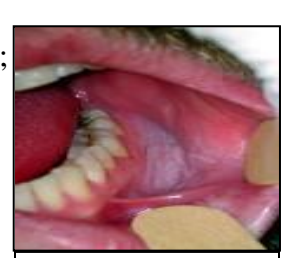
WHITE PATCHES ON THE GUM AND CHEEK AREAS

Leukoplakia is a condition where white patches form on the soft tissues of the mouth; and can not be removed. Its cause is unknown, but smoking is believed to trigger leukoplakia. Of the different types of tobacco, chewing tobacco and snuff play a key role in causing leukoplakia. As many as three out of four regular users of "smokeless tobacco" products eventually develop leukoplakia where they hold the tobacco against their cheek(s). In most cases, leukoplakia is non-cancerous, but it can be dangerous and may lead to cancer in a small percentage of individuals. It's also important to note that many oral cancers appear next to areas of leukoplakia.